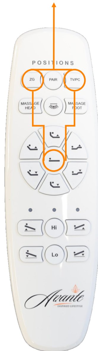
ERGOADJUST LO LO HAND CONTROLLER

PRESS AND HOLD TO CHANGE PRE-SET POSITIONS