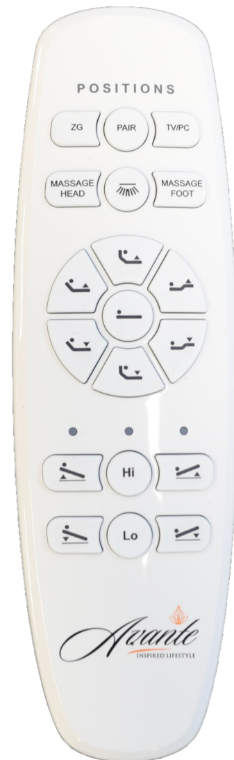
ERGOADJUST LO LO HAND CONTROL