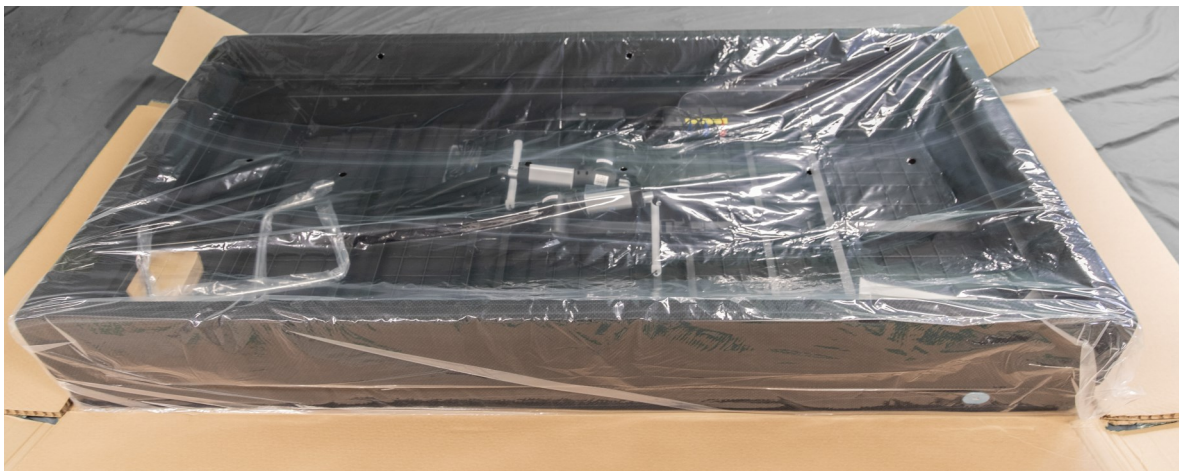
Step 1: Unpack the carton box