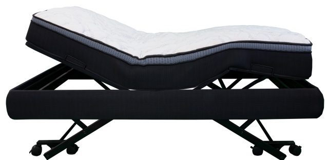
Raised Position with Head and Foot Up