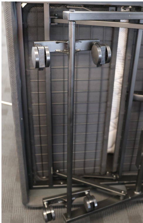
Attach the level bar as shown