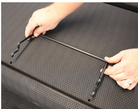
Insert the retainer bars