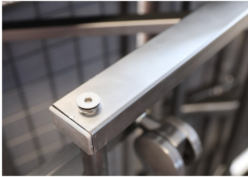
Bolt and Bushes