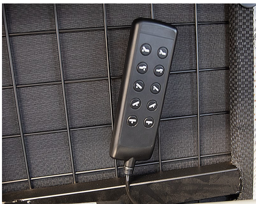
Step 2: Cut the zip ties