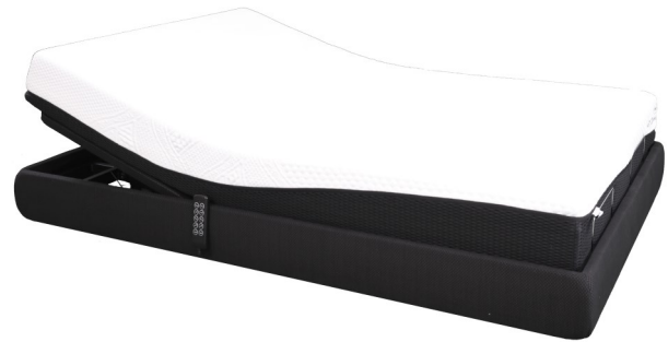
Lower Position Close to Ground